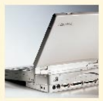
Smooth operator: the optional port replicator is a one-touch connection to all your office hardware