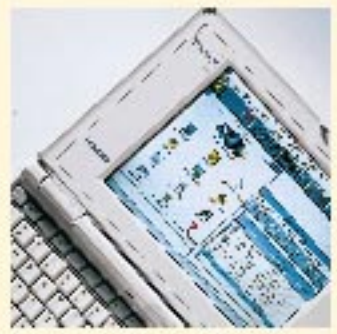
256 colours at your command, for super-fast, brilliant displays on either TFT or STN screens