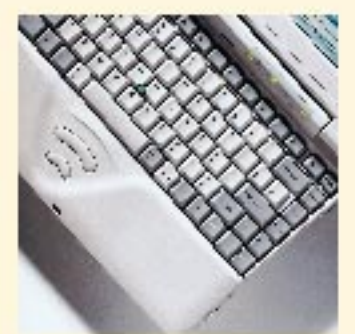
Control at your fingertips: a full sized keyboard with an integrated MousePoint and mouse keys