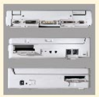
The ultimate point of contact. Satellite comes with all the connectivity options of a high-end desktop PC