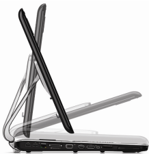
Unique hinge design for screen adjustability