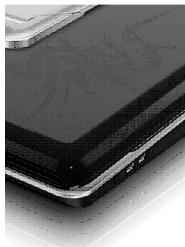
Dragon, the new high-impact HP Imprint finish